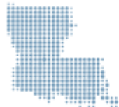
Table 5: Submitted Applications and Grants Offered by Senate District.